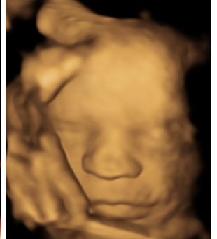
35 weeks 3D Image