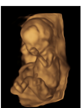
14 weeks 3D Image