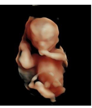
14 weeks 3D Image with HD Live